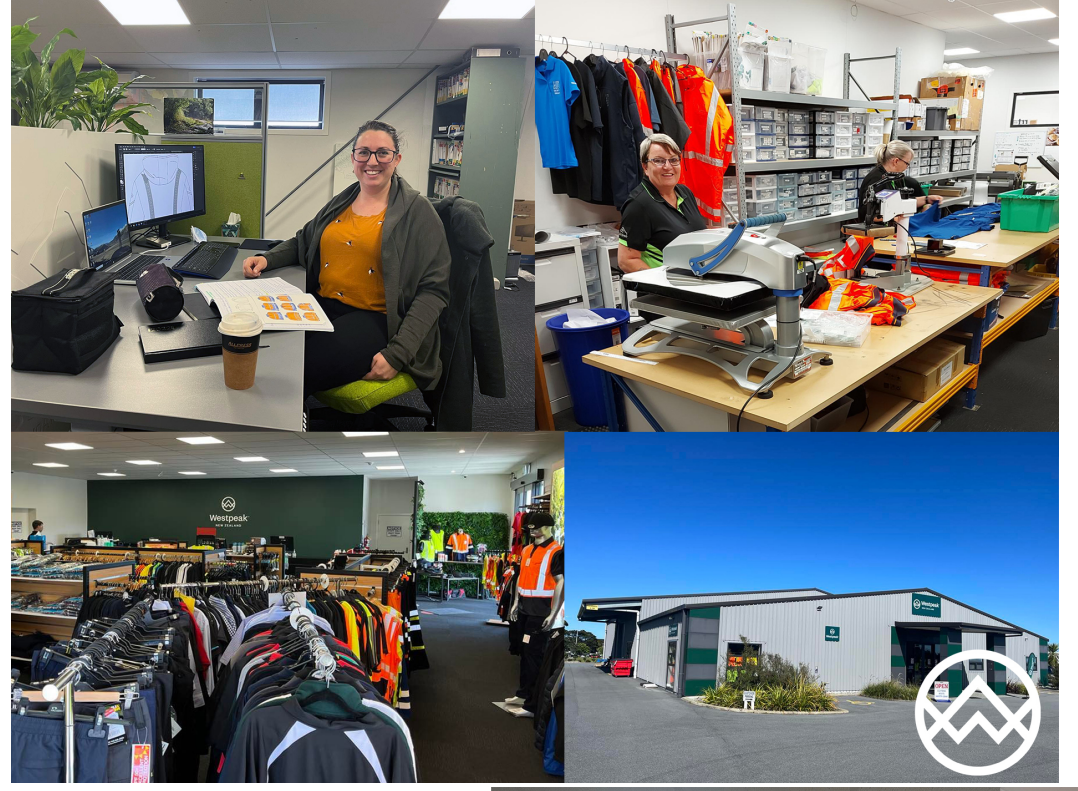
Working for Westpeak™ gives me the security of a rewarding job while the hours work around my busy life outside the office - Head of Marketing & Sustainability

Here at Westpeak<sup>™</sup> we offer our staff fantastic career opportunities where you can come enjoy your time at work for a family run business that cares about people. Whichever department you are placed in at Westpeak<sup>™</sup> there is up-skilling opportunities to grow your knowledge and skill set. No day is the same as we look after nationwide customers and strive to be New Zealand's most trusted uniform supplier. With a great group of employees from all over the region we welcome you to come join our team!